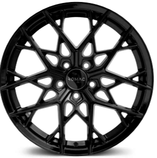
VORTEX PAGE 11