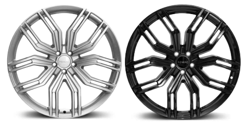
SILVER GLOSS BLACK