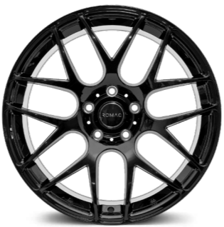
RADIUM PAGE 04