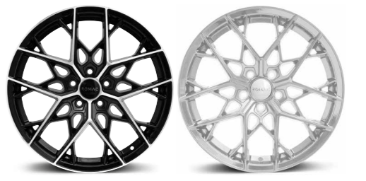
BLACK POLISHED SILVER