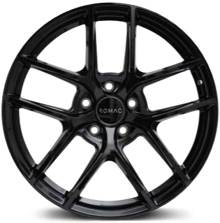
DIABLO PAGE 07