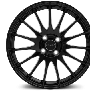
PULSE PAGE 09