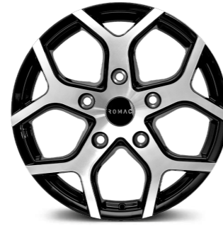
COBRA PAGE 06