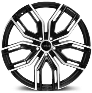
CATALINA PAGE 10