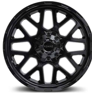
UTAH PAGE 03