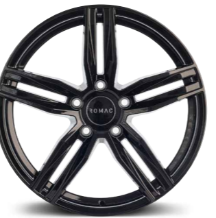
VENOM PAGE 05