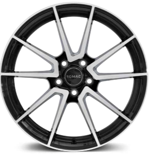
AIR PAGE 08