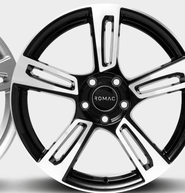
BLACK / POLISH