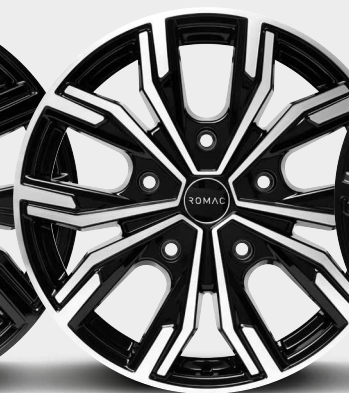
BLACK / POLISH